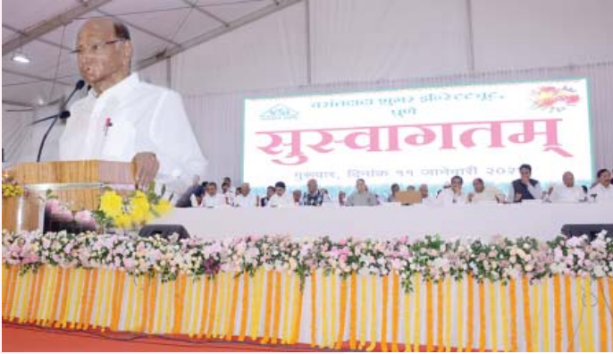
Mr. Sharad Pawar, Hon. President, VSI, addressing Annual General Meeting