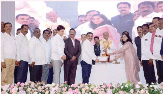
Late Raosahebada Pawar Award for Best Distillery being presented to SM Shankarrao Mohite Patil SSK Ltd., Dist. Solapur