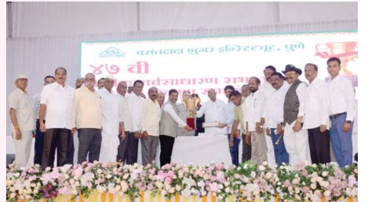
Late Kisan Mahadev Alias Abasaheb Veer Award for Best Environmental Conservation being presented to Padmashri Dr. DY Patil SSK Ltd., Dist. Kolhapur