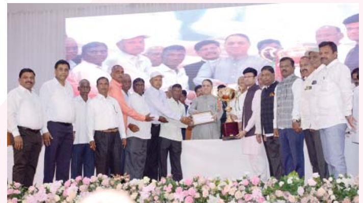
Late Vasantdada Patil Award for Best Overall Performance to Shree Chhatrapati Shahu SSK Ltd., Dist.: Kolhapur