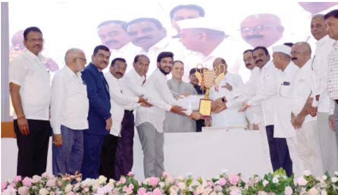
Late Vilasraoji Deshmukh Award for the Most Innovative Sugar Factory to Sahakar Maharshi Shankarrao Kolhe SSK Ltd., Dist.: Ahmednagar