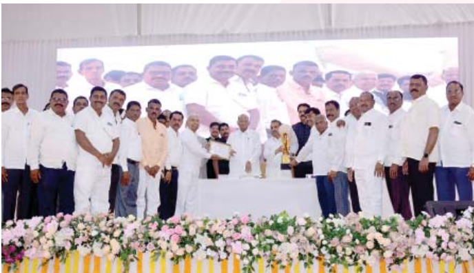
Best Cane Development Officer (South Zone) being presented to Krantiagrani Dr. GD Babu Lad SSK Ltd., Dist. Sangli