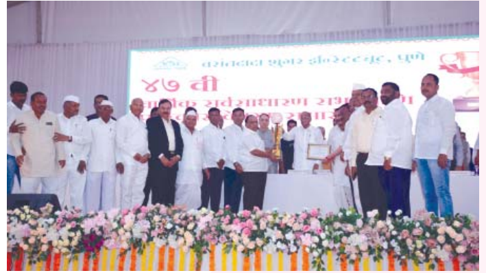
Best Financial Management Award (South Zone) being presented to Dr. Patangrao Kadam Sonhira SSK Ltd., Sangli