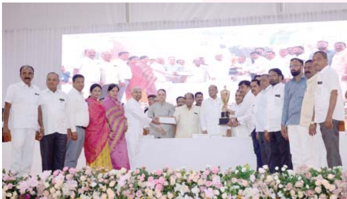
Best Technical Efficiency Award (First prize in South Zone) being presented to Krantiagrani Dr. GD Bapu Lad SSK Ltd., Dist. Sangli