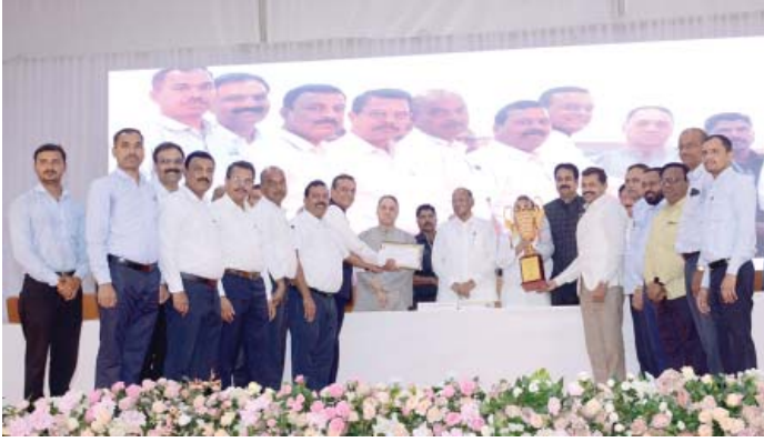
Late Karmyogi Shankarraoji Patil Award for Best Overall Financial Management to Daund Sugar Pvt.Ltd., Dist.: Pune