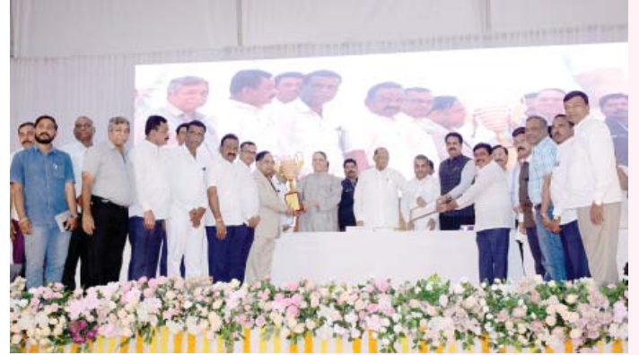
Late Dr. Appasaheb Alias SR Patil Award for Best Overall Cane Development Performance Jointly given to Yashwantrao Mohite Krishna SSK Ltd., Dist.: Satara