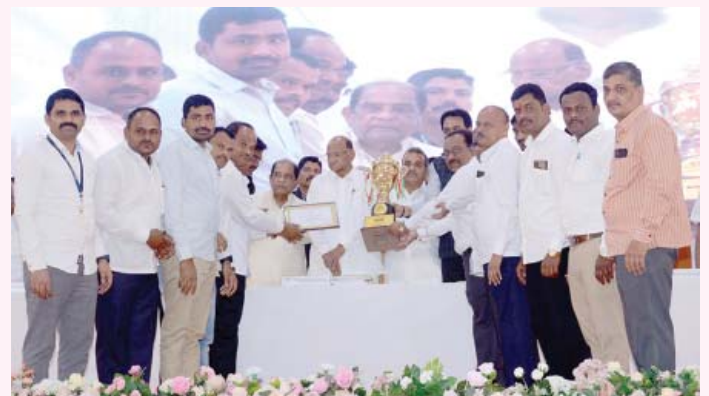
Best Technical Efficiency Award (First prize in Central Zone) being presented to Asti Sugar Ltd., Dist. Solapur