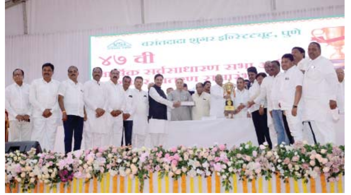
Best Technical Efficiency Award (First Prize in North-East Zone) being presented to 1) Rena SSK Ltd., Dist. Latur jointly with 2) Vilas SSK Ltd., Dist. Latur