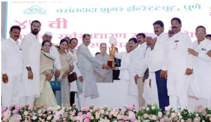
Best Financial Management Award (Central Zone) being presented to Bhimashankar SSK Ltd., Dist. Pune