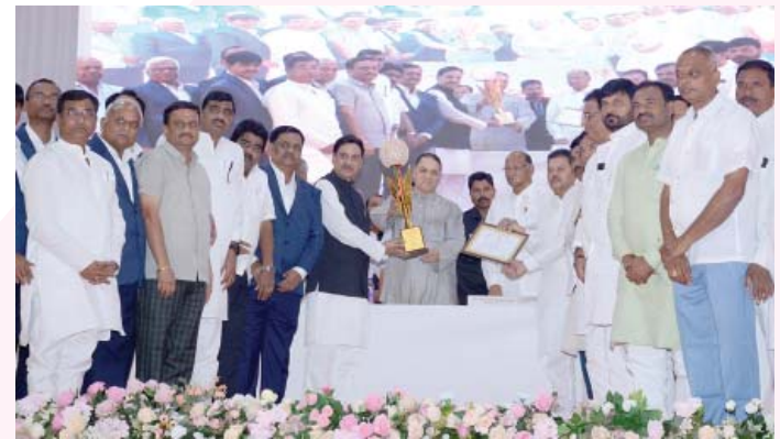
Best Financial Management Award (North-East Zone) being presented to Rena SSK Ltd., Dist. Latur